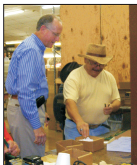
Congressman Conaway and Paul Valdez

One product that is of particular interest is the bio-degradable Navy Submarine Wet Bag. This bag is used to dispose of food and other bio-degradable waste when the submarines are submerged. This bag is not only manufactured in West Texas, it is made from 100% cotton. He was given a sample bag to take to the next local Farmer's Bureau meeting.